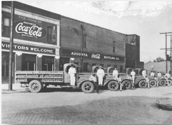
Augusta Coca-Cola Bottling Company 1902