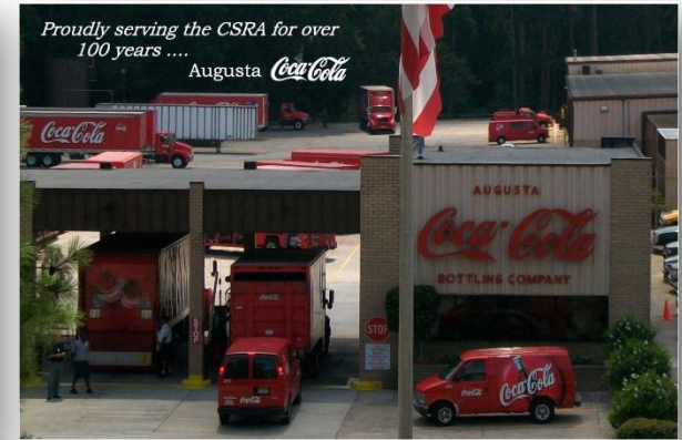
Augusta Coca-Cola Today